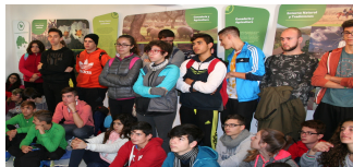
Active Tourism Room