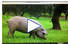
Iberian Pork promotional video